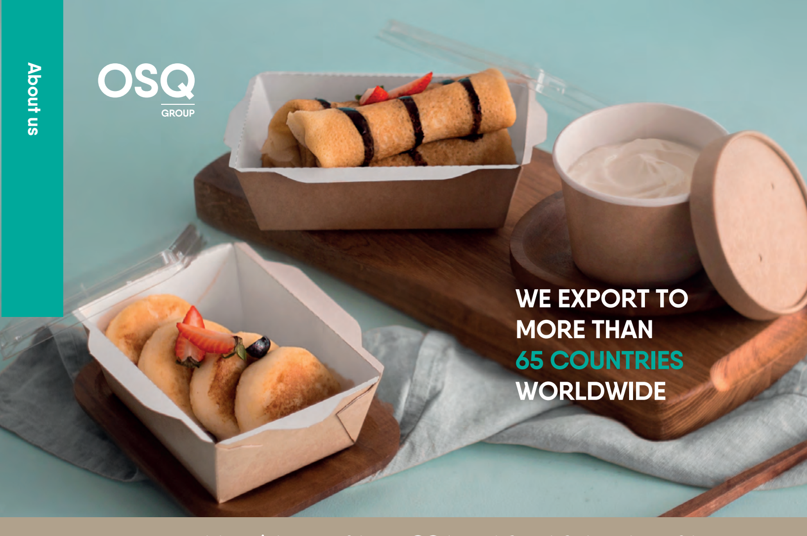
· EUROPE · LATIN AMERICA · MIDDLE EAST · ASIA · AFRICA